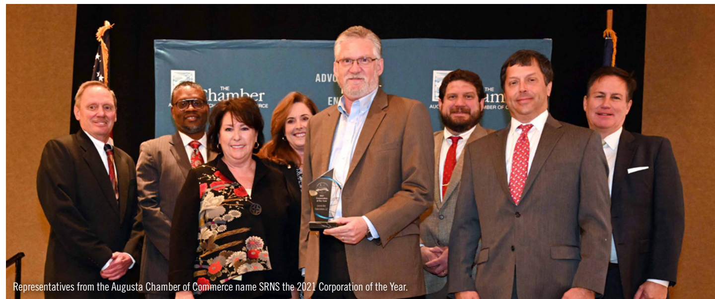
Representatives from the Augusta Chamber of Commerce name SRNS the 2021 Corporation of the Year.