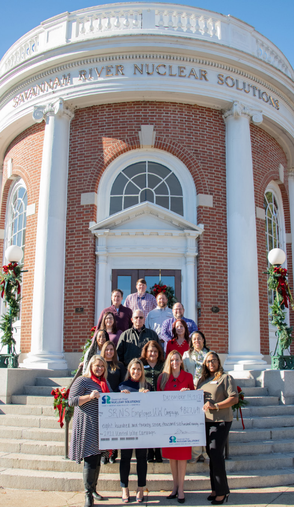
SRNS employees recently surpassed their $800,000 United Way campaign goal by raising $827,691, contributing to the $1.4 million sitewide goal.