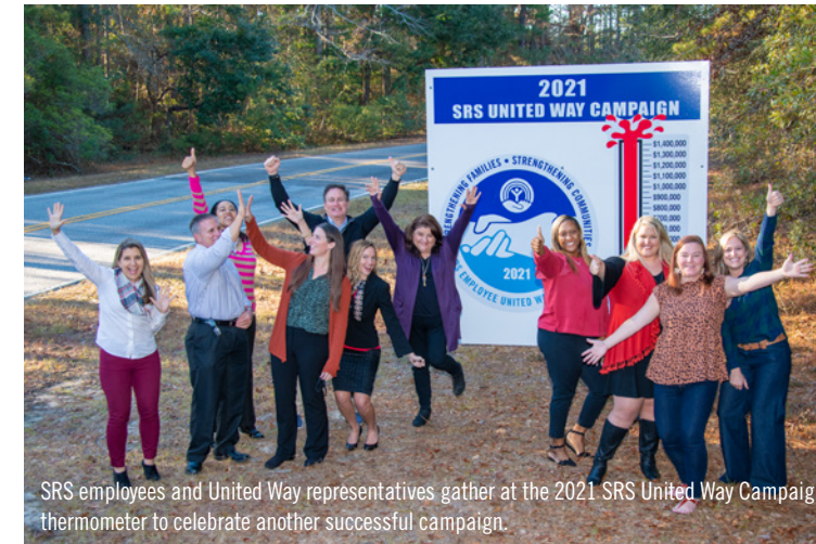
SRS employees and United Way representatives gather at the 2021 SRS United Way Campaign thermometer to celebrate another successful campaign.

"We would not have been able to have such a great campaign without the help from our SRS family," she continued. "I especially want to express my appreciation to all the campaign chairs for their leadership within their organizations throughout this year's campaign. We would not have been able to meet our goal without each and every one of you."