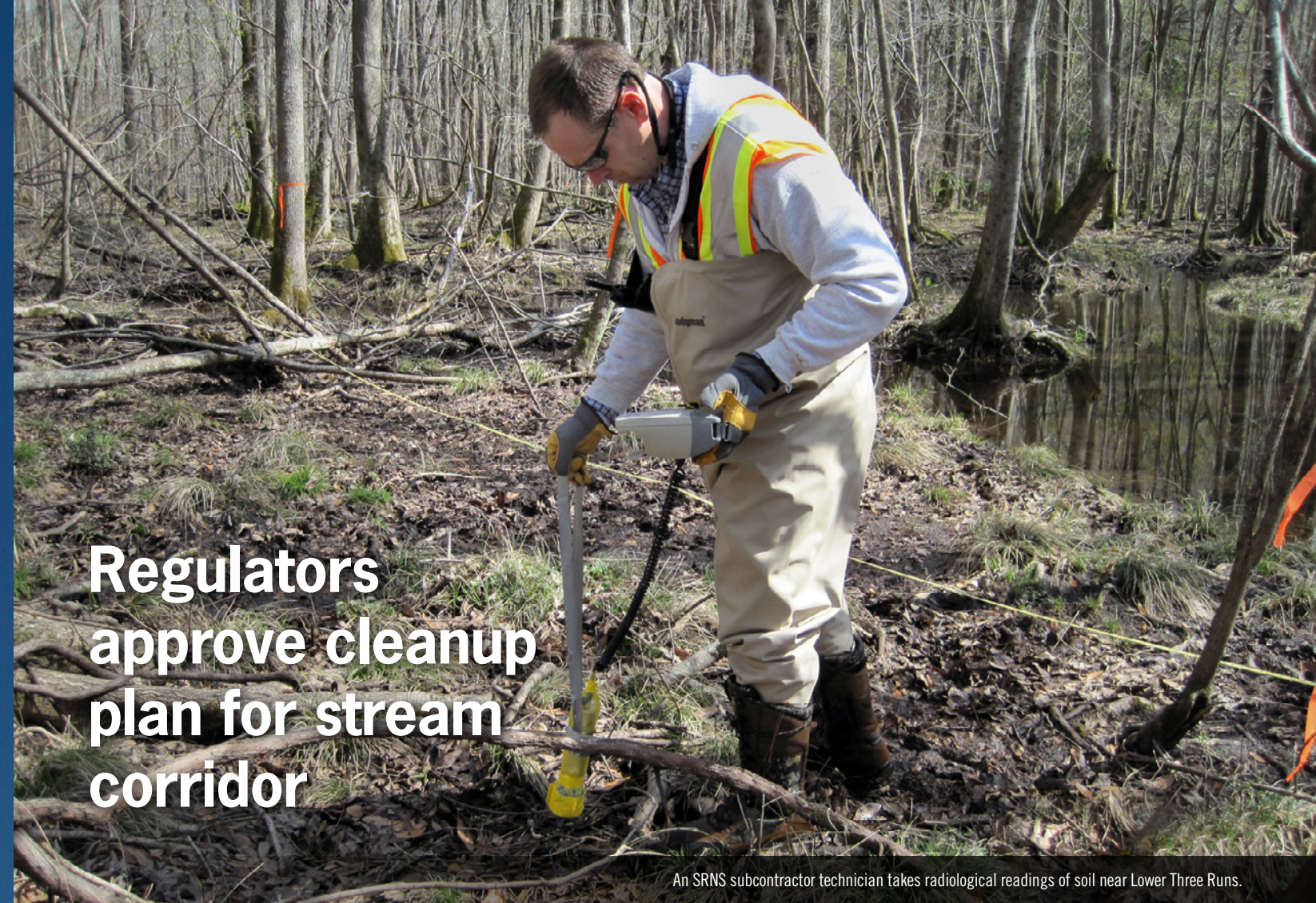
An SRNS subcontractor technician takes radiological readings of soil near Lower Three Runs.

Photos in this issue include prior COVID-19 guidelines, regarding no mask requirements for vaccinated employees.