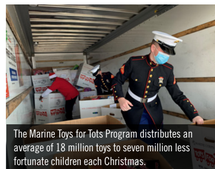
The Marine Toys for Tots Program distributes an average of 18 million toys to seven million less fortunate children each Christmas.

In addition to Toys for Tots, SRS started participating in the Salvation Army Angel Tree program in 2000. Over the past 20 years, SRS employees have been adopting Angels and have given gifts to over 16,000 children in the CSRA. During this year's campaign, 492 Angels were adopted.