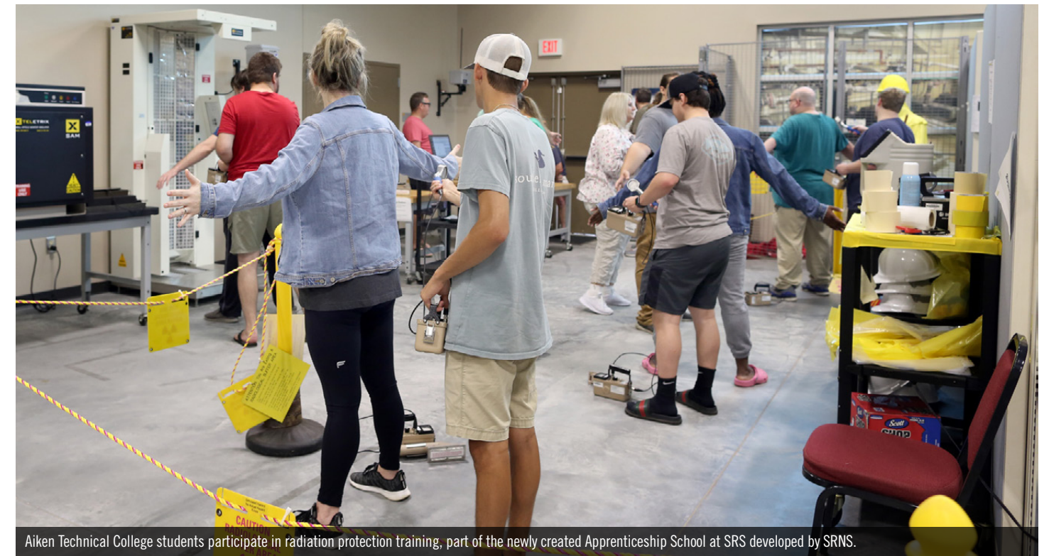
Aiken Technical College students participate in radiation protection training, part of the newly created Apprenticeship School at SRS developed by SRNS.

Detailed information regarding the Apprenticeship School can be found at www.srs.gov/general/outreach/apprenticeship/apprenticeship_school.htm .