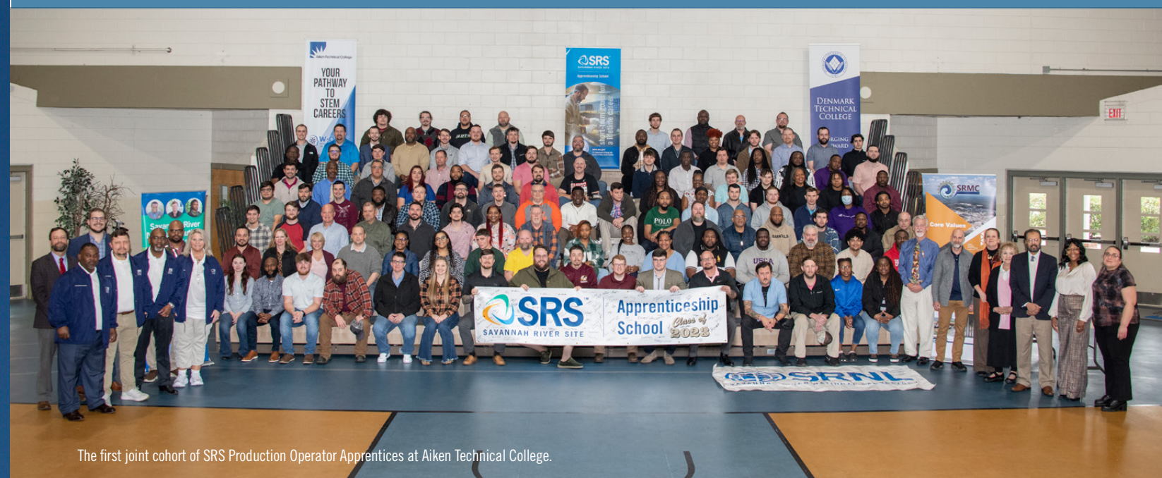
The first joint cohort of SRS Production Operator Apprentices at Aiken Technical College.

Two other SRS contractors recently collaborated with SRNS to welcome the first joint cohort of Production Operator Apprentices as part of the Nuclear Fundamentals program, which will provide over 100 trained operators to the Site once the program is completed.