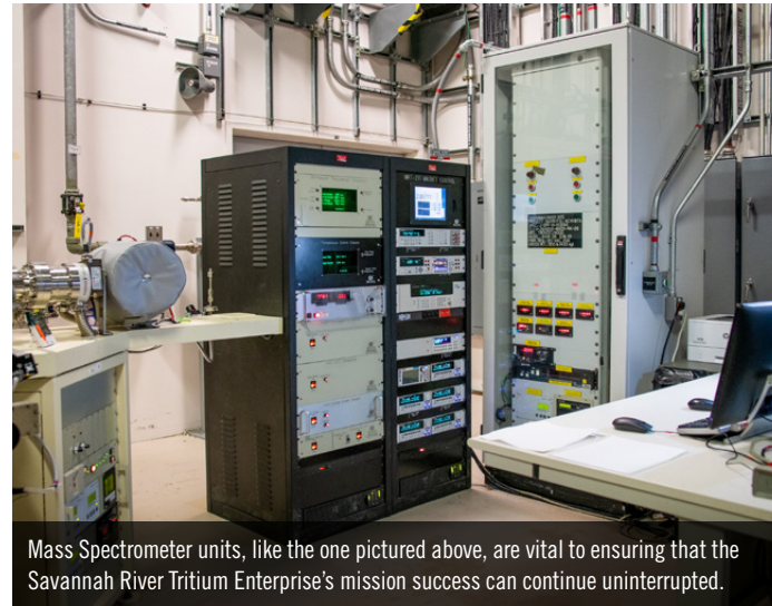
Mass Spectrometer units, like the one pictured above, are vital to ensuring that the Savannah River Tritium Enterprise’s mission success can continue uninterrupted.

SRTE currently has five mass spec units which are crucial to mission success, the production of tritium for use within our nation’s