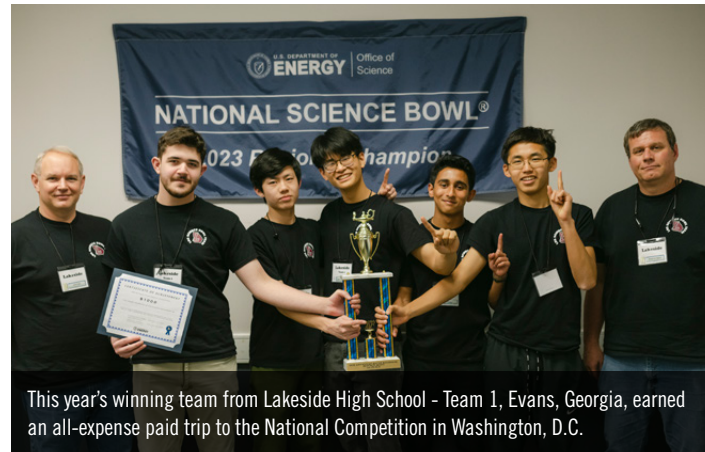
This year's winning team from Lakeside High School - Team 1, Evans, Georgia, earned an all-expense paid trip to the National Competition in Washington, D.C.

The format used is similar to the television show "Jeopardy," where teams face off during a timed period of fast-paced question-and-answers. Questions cover a wide range of academic disciplines including biology, chemistry, energy, math, physics, earth and space science.