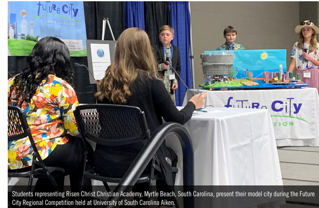
Students representing Risen Christ Christian Academy, Myrtle Beach, South Carolina, present their model city during the Future City Regional Competition held at University of South Carolina Aiken.