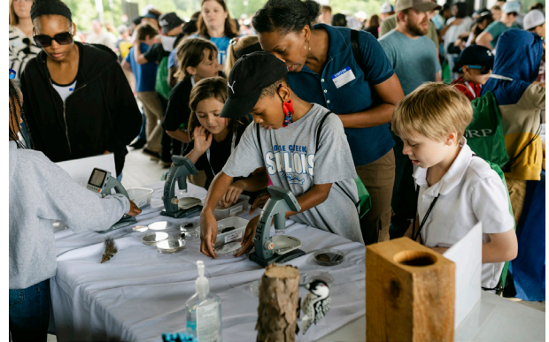
Located at the entrance of the stadium, the SRS education outreach booth was a fan favorite. Students are captured identifying different organisms under a microscope.