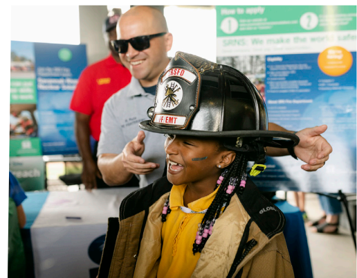
The SRNS Fire Department assisted students with fire protection equipment and explained fire safety plans for each student visiting the booth.

SRS education outreach provided microscopes for students to examine rocks, minerals, insects, seashells, snakeskin and butterfly wings. Students completed a bracelet building activity that taught the importance of a binary code and software engineering. The STEM “Step into my Job” cutouts displayed different career opportunities in science, maintenance and engineering.