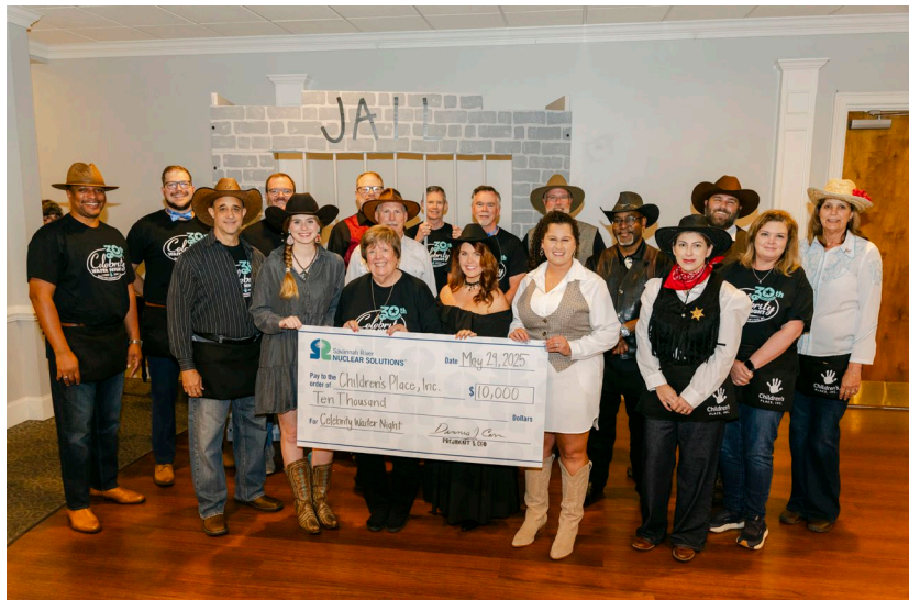
Savannah River Nuclear Solutions employees presenting a check to Children's Place, Inc.